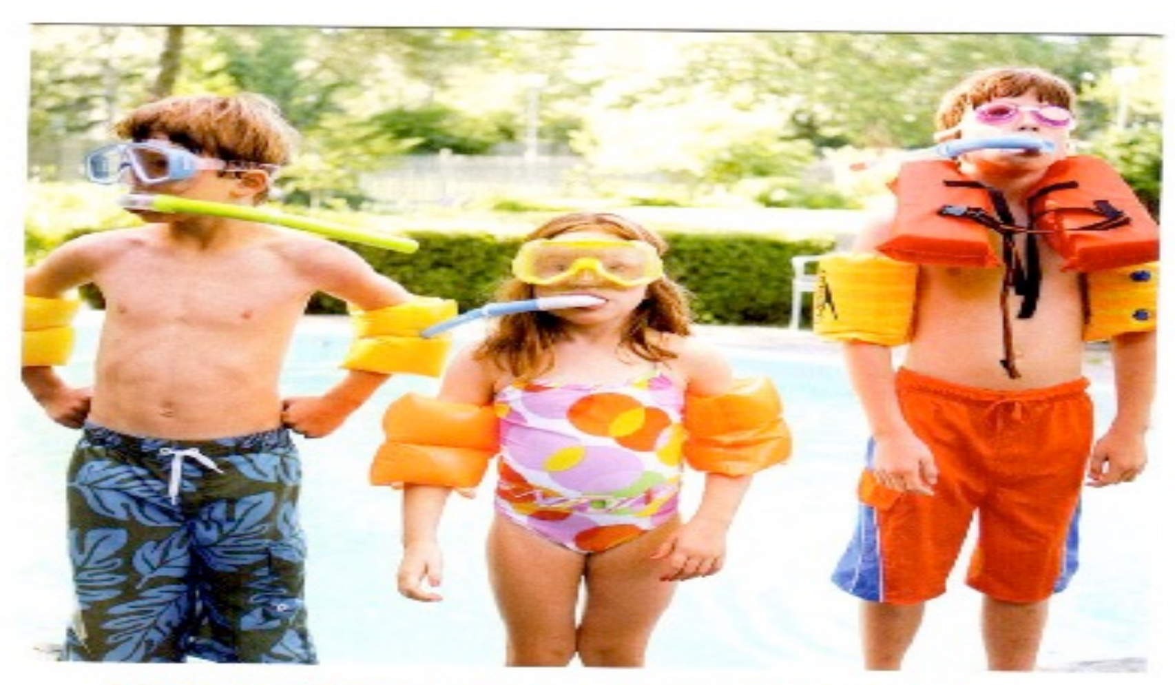
LIFE IS EASIER WHEN YOU'VE GOT A POSSE.